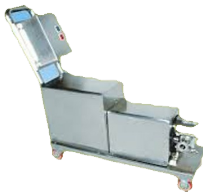
VFD - Trolley Mounted